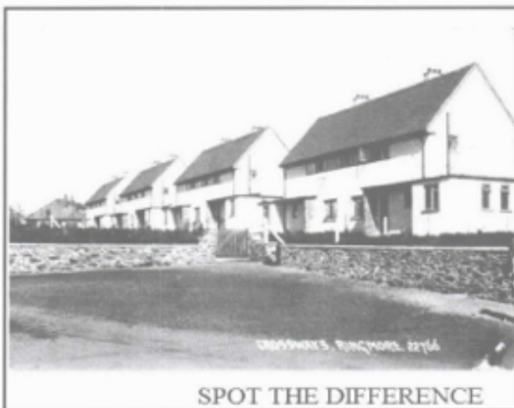
SPOT THE DIFFERENCE

inviting all residents and locals, past and present, to add their memories and experiences at the meeting on April 17 th .