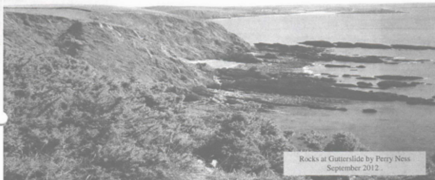
Rocks at Gutterslide by Perry Ness September 2012

Deadline for November's issue : 25th October