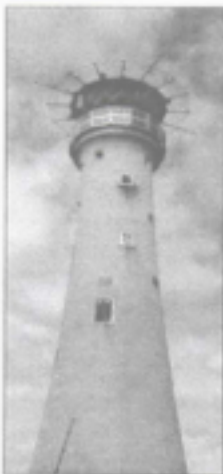
Sold in aid of the Ringmore Parish Room