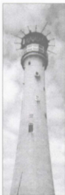
Sold in aid of the Ringmore Parish Room