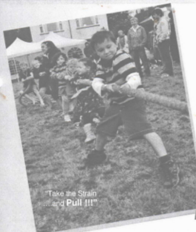
"Take the Strain ... and Pull !!!"

Deadline for October issue : 24th September 2012