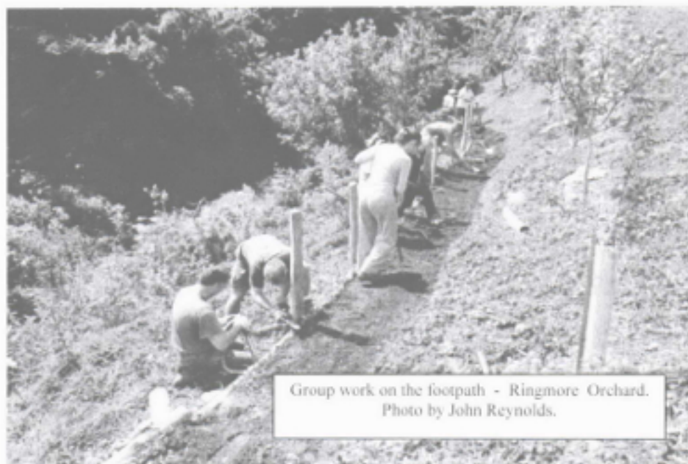
Group work on the footpath - Ringmore Orchard.