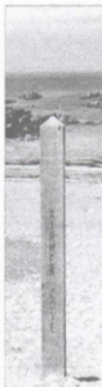
Sold in aid of the Ringmore Parish Room