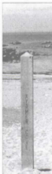
Sold in aid of the Ringmore Parish Room