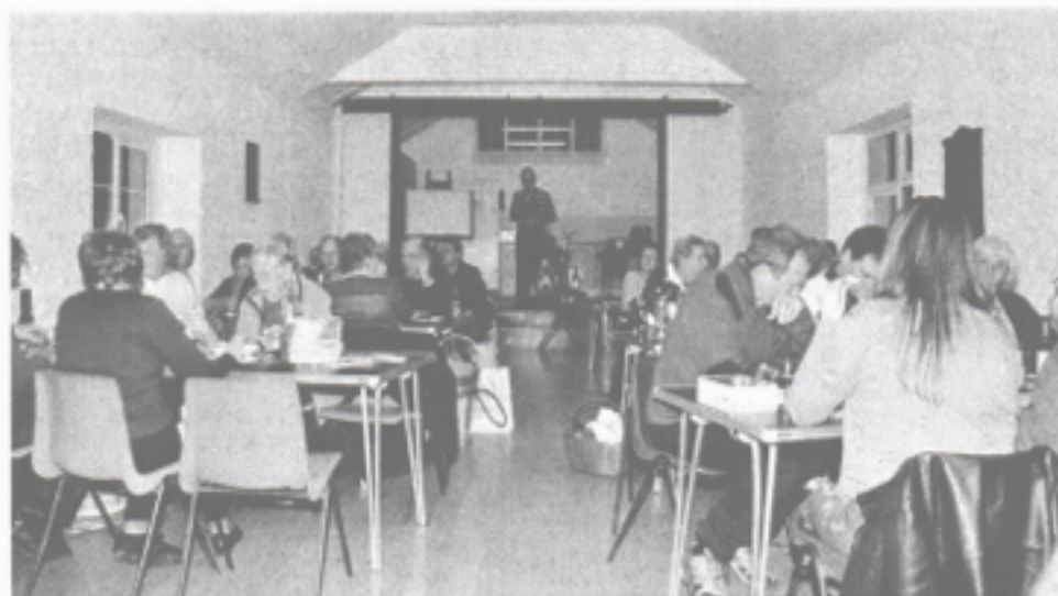
Parish Room Quiz, February 2011

An enjoyable evening that raised £333.00 towards the Parish Room's new roof fund. Thank you to all who supported the event.