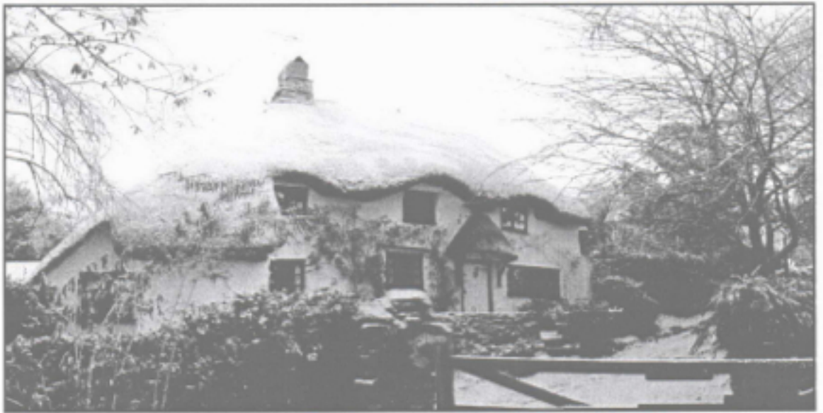
Hill Cottage , December 2010