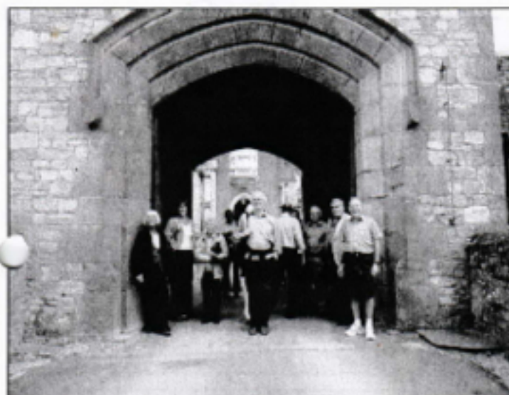
Ringmore Historical Society's visit to Powderham Castle See report page 9

Apologies for the problems with our email last month which resulted in one or two missed contributions and is why we are printing two lots of rainfall this month: