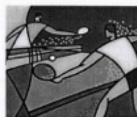
Table tennis is probably furthest from most people's minds during this hot sunny weather but this is just a little reminder that the club continues to meet on Tuesday evenings throughout the summer come rain or shine. Locals and visitors are welcome to join us from 7.30 onwards; it is an evening of good fun and a bit of exercise with a refreshment break to chat. Hope to see you there,