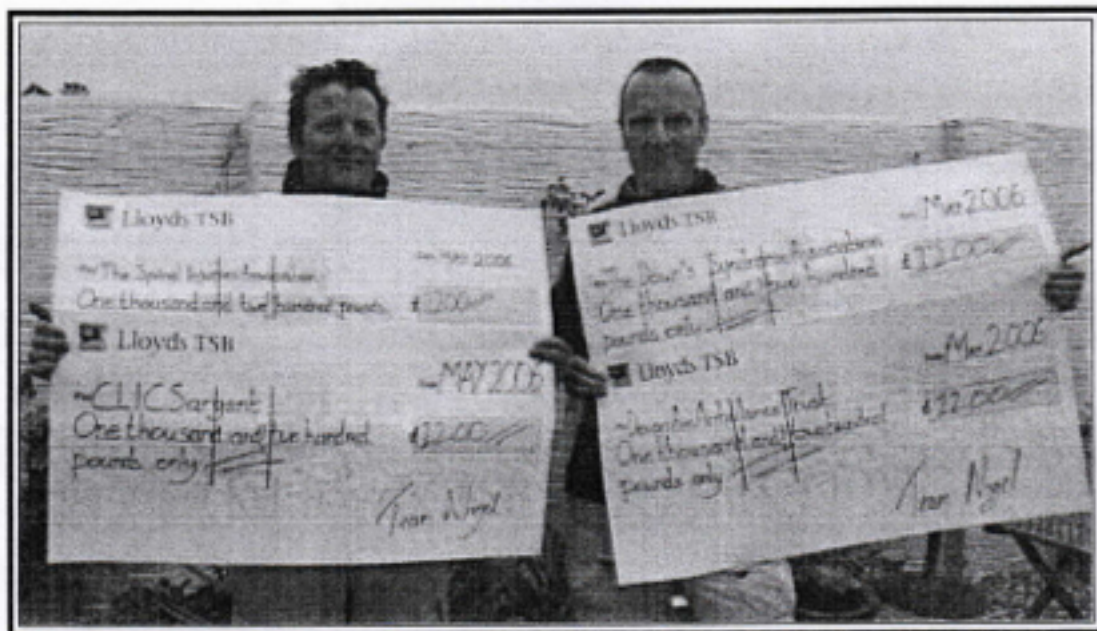
The fruits of their labours

An attractive young lady remains nameless Although breathtakingly shameless She paraded quite Starkers Before nosey-parkers Who gleefully claimed she was .... blameless