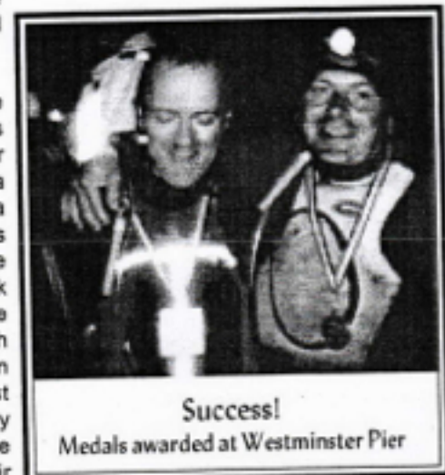
Success! Medals awarded at Westminster Pier

The thirty-one hours include three unscheduled capsizes - one of which is the result of a very aggressive and over protective swan taking a dislike to Nigella 2. These unscheduled stops along with a reduction in boat speed through the hours of darkness mean that Team Nigel are facing a major crisis when they hit daybreak and the River Thames - they may not have enough time to get to Teddington for high tide (paddling against an incoming tide on the Thames beyond this point is almost impossible and has defeated many crews). However, from somewhere the team find enough energy to increase their average speed - no doubt boosted by a hot meal and a change into dry clothes. As a result they arrive at Teddington only an hour behind schedule. The final seventeen miles are a real test as there is nowhere to get out of the boat and the strain on the