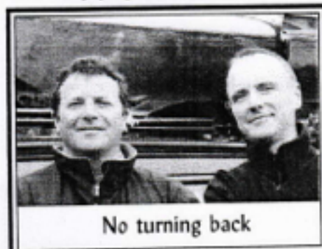
No turning back

evening but they are just as soon conveniently forgotten in the cold light of the following day.