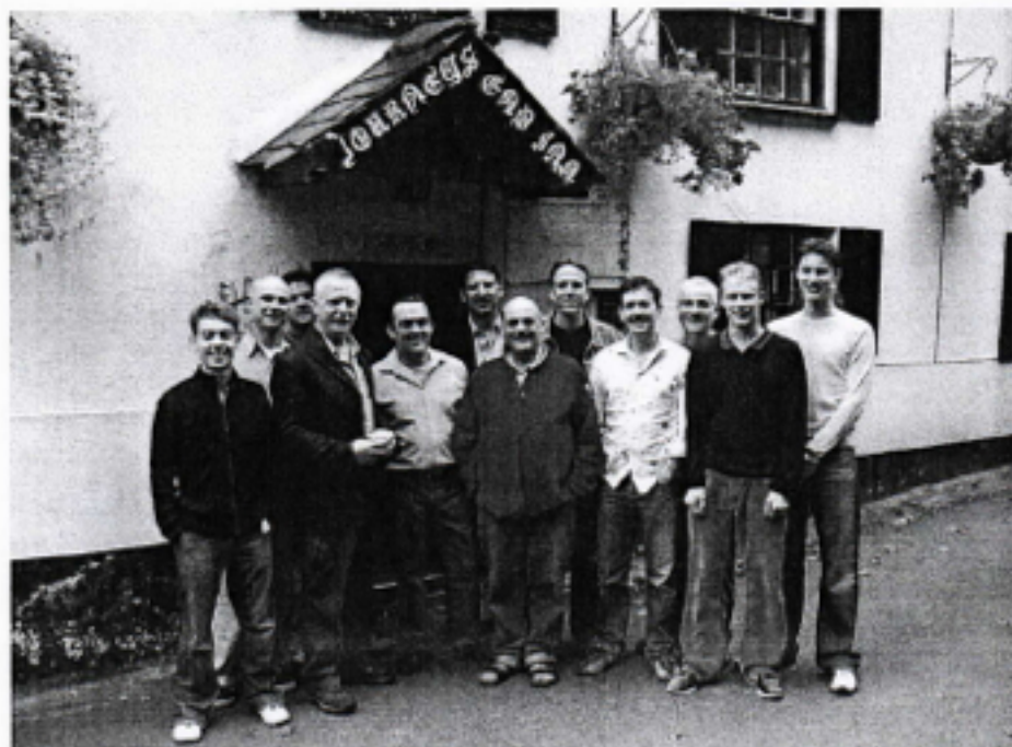
The cast of Journey's End visited Ringmore for lunch on the day of the trip