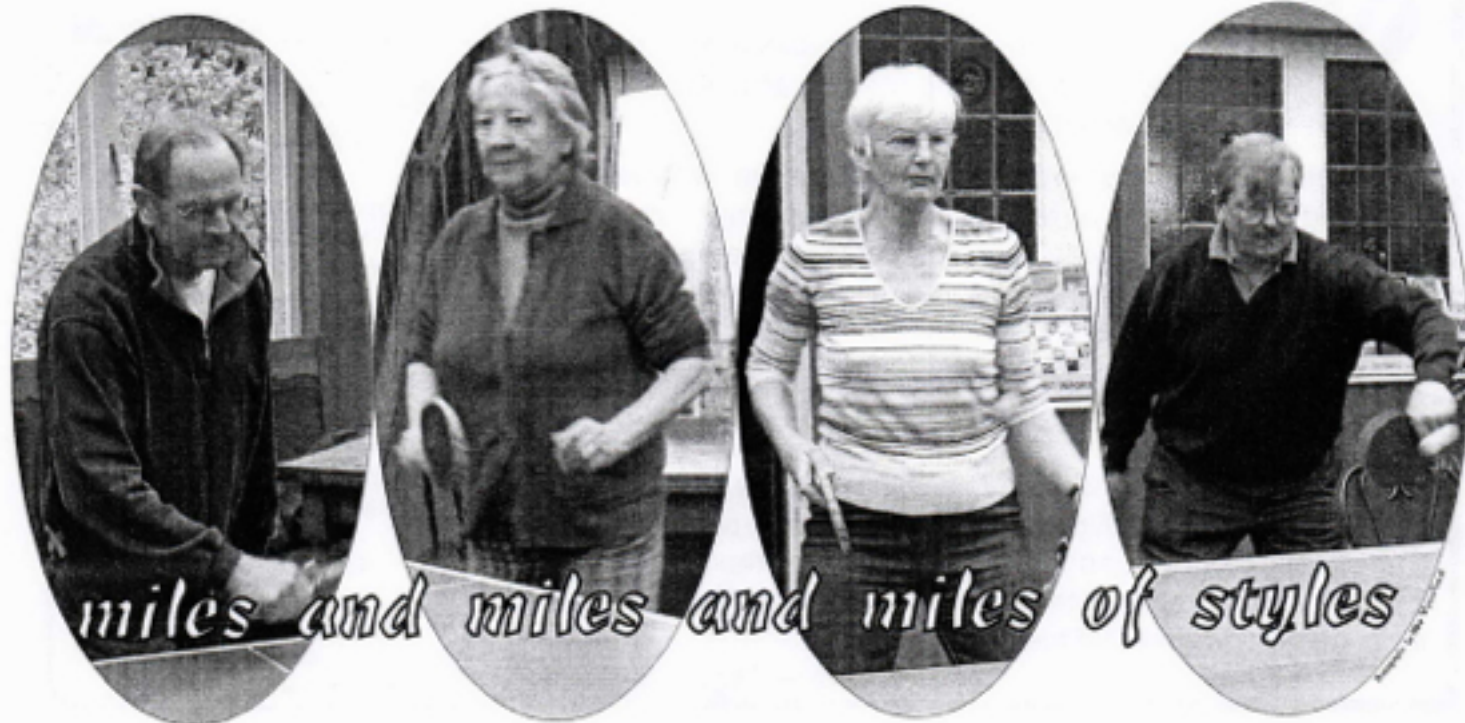
Table Tennis Tournament