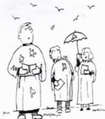
Open Air Services had their drawbacks at the Seaside