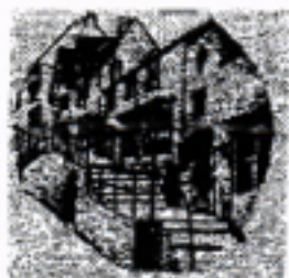
OPPOSITE COUNTRY PINE FURNITURE

Variety of antiques, valve radios, fountain pens, clocks. Extensive range of Art Deco items. Old and Interesting items purchased