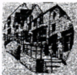
OPPOSITE COUNTRY FINE FURNITURE

Variety of antiques, valve radios, fountain pens, clocks. Extensive range of Art Deco items. Old and interesting items purchased