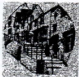
OPPOSITE COUNTRY PINE FURNITURE