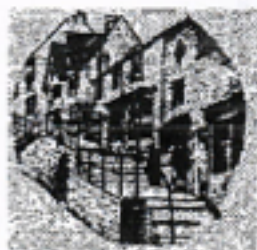
OPPOSITE COUNTRY FINE FURNITURE

Variety of antiques, valve radios, fountain pens, clocks. Extensive range of Art Deco items. Old and interesting items purchased