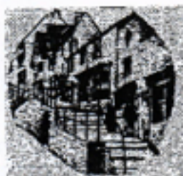
OPPOSITE COUNTRY FINE FURNITURE

Variety of antiques, valve radios, fountain pens, clocks. Extensive range of Art Deco items. Old and interesting items purchased