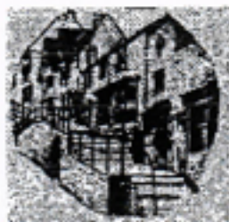
OPPOSITE COUNTRY FINE FURNITURE