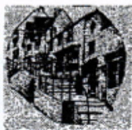
OPPOSITE COUNTRY FINE FURNITURE

Variety of antiques, valve radios, fountain pens, clocks. Extensive range of Art Deco items. Old and interesting items purchased