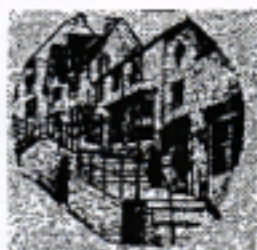
OPPOSITE COUNTRY FINE FURNITURE