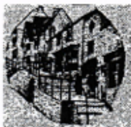
OPPOSITE COUNTRY FINE FURNITURE