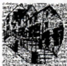
OPPOSITE COUNTRY FINE FURNITURE