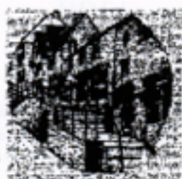
OPPOSITE COUNTRY FINE FURNITURE