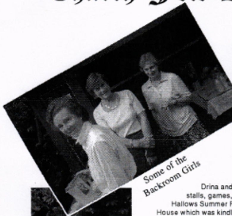
Some of the Backroom Girls