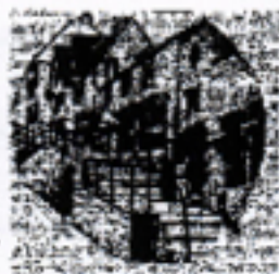
OPPOSITE COUNTRY FINE FURNITURE