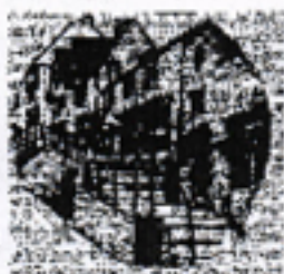
OPPOSITE COUNTRY PINE FURNITURE

Antiques & Collectibles Variety of antiques, valve radios, fountain pens, clocks. Extensive range of Art Deco items. Old and interesting items purchased