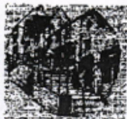
OPPOSITE COUNTRY FINE FURNITURE