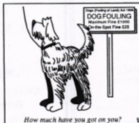
How much have you got on you? 1

Further information can be obtained from the Dog Warden at SHDC, 01803 861234.