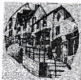
OPPOSITE CONTEXT ART GALLERY