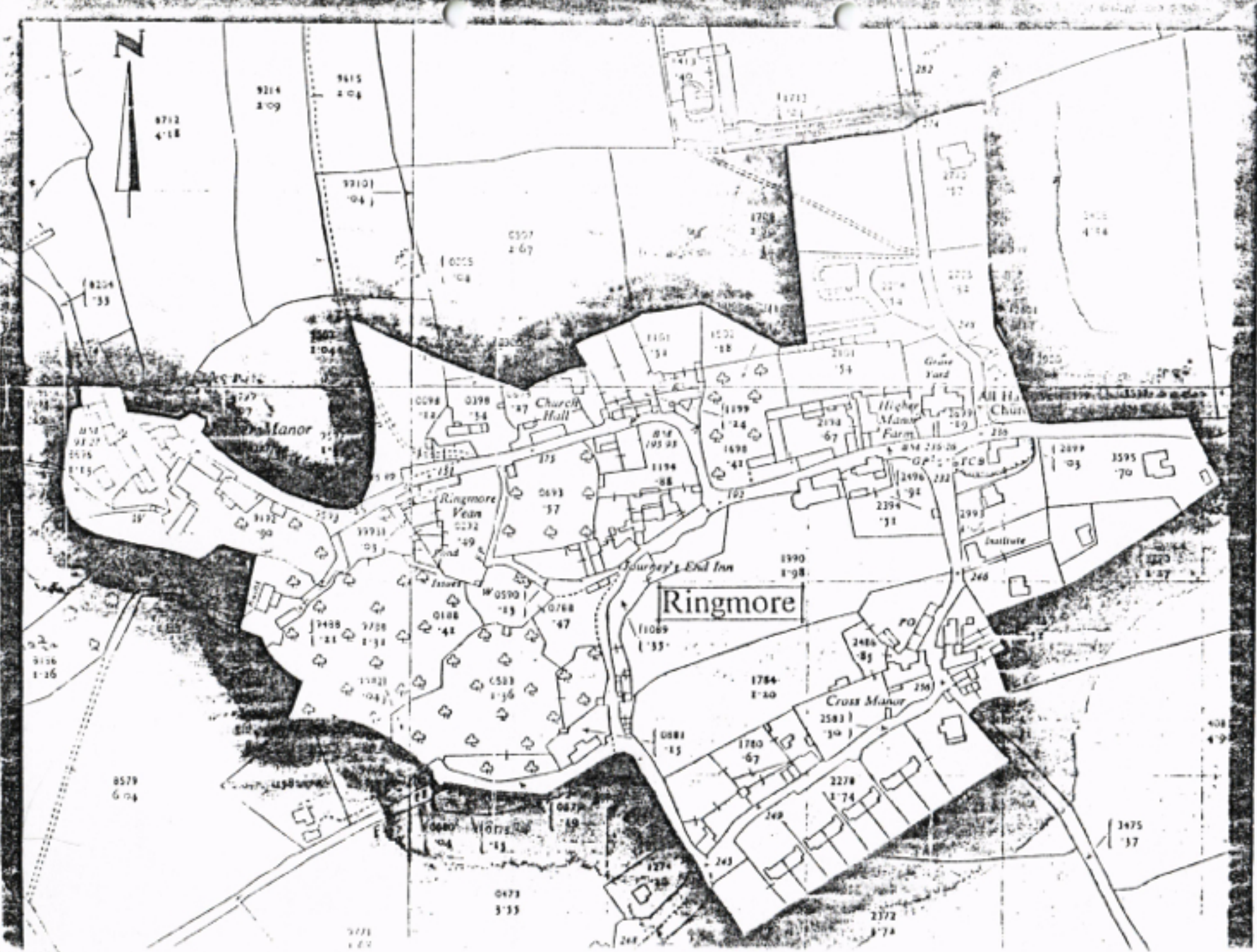
AREA OF THE VILLAGE WITHIN THE COASTAL BELT.