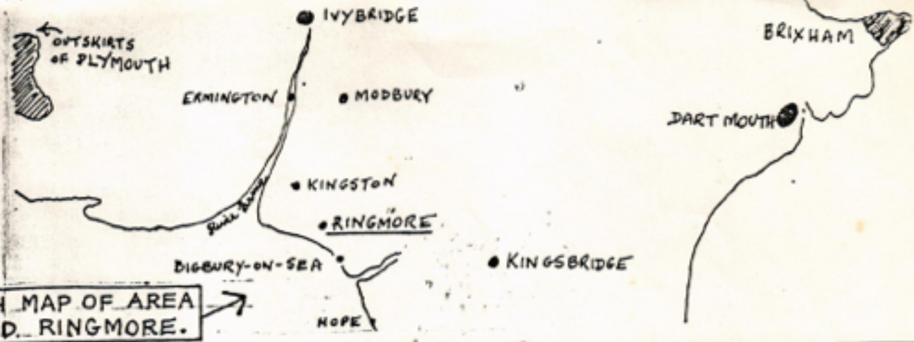
SKETCH MAP OF AREA AROUND RINGMORE.