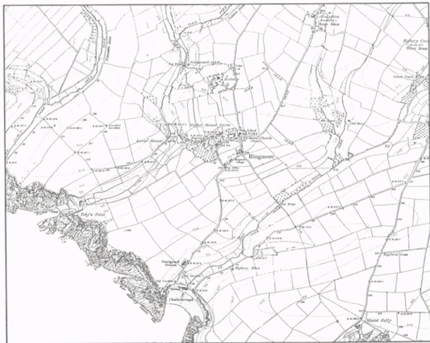
6" O.S. map (1889)