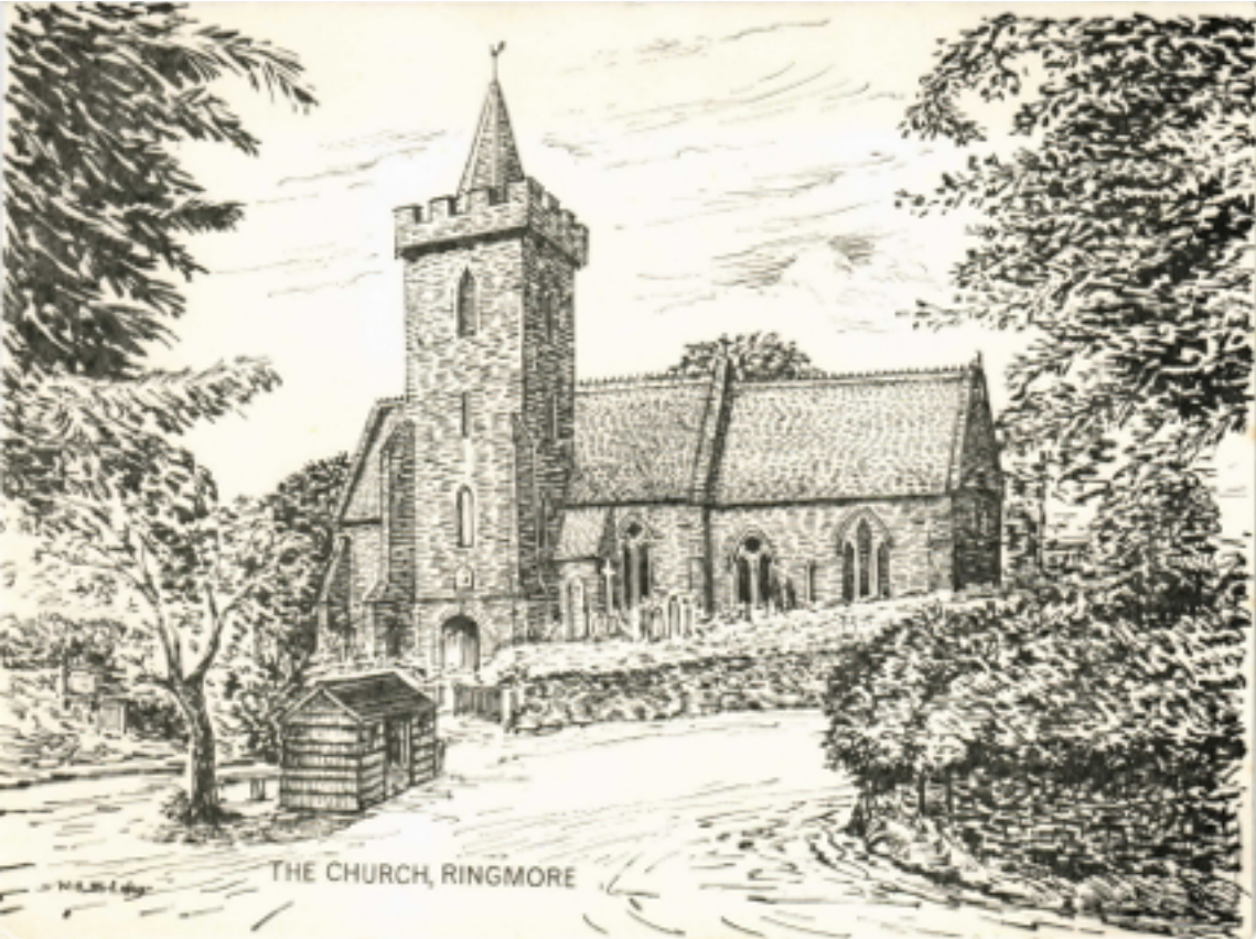
THE CHURCH, RINGMORE