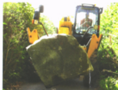
Taking the St Anne's stone along Rectory Lane